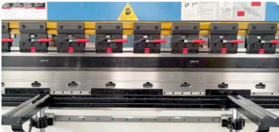
GENUO One-Key Double-Sided Fast Clamp

GENUO provides a variety of tooling solutions to meet your different production needs. Not only that, we are also experts in the field of bending tools. If you have any special bend, our engineers will customize special tools for each workpiece, which greatly expands your press brake function and revenue. To help greatly improve your productivity and business benefits.