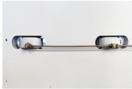
CNC Hydraulic Crowning