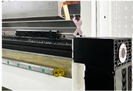
CNC Motorized Crowning