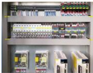
Stable Electrical Cabinet