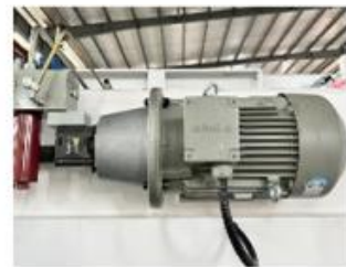
Low Noise and Powerful Force