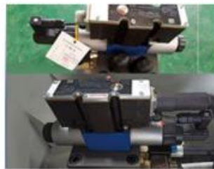
Superior Hydraulic System