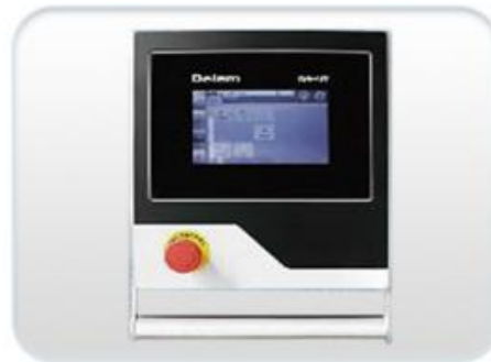
● Delem DA-41T/42T