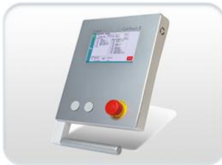
● CYBELEC CybTouch 8