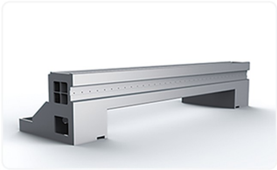
Aviation Aluminum Beam

The Fra Hig newnce h gen MO prec erat TO isio ion VA n, of RIO high Sch Red spe nei ucered, der is reali elecwith zes tric highclos al ed- swit tran loop ch smi cont co ssio rol mp n of one effc posi nts, ienc tion, dur y , spe abl low ed e to ene and ens rgy torq ure con ue the sum sta ptio bilit n y of and you sup r erio ma r chinperf e orm lon anc g e. ser vice life.